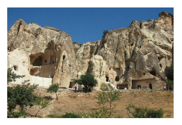
Open Air Museum

Breakfast at your hotel, pick-up around 9:30 – 10:00 AM for your Northern Cappadocia Tour beginning with Goreme Panorama . Enjoy stunning views of Goreme Village and the surrounding area. Continue to the Open Air Museum which resembled a vast monastic complex comprised of scores of refectory monasteries each with their own church. One of the first two UNESCO World Heritage Sites in Turkey, see the finest of rock-cut churches and their beautiful frescoes.